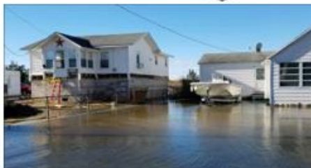
A photo showing a home raised through the Eastern Shore Long Term Recovery Program next to a home waiting to be raised during "sunny day flooding."

Matthew 25 calls us to care for one another and our community. Our neighbors on the Eastern Shore need our help. They deal with significant flooding issues. The Eastern Shore Long Term Recovery Committee leads an initiative to lift houses and place them on higher and more secure foundations. This won't stop the floods, but it will save homes.